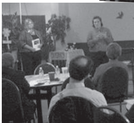
A client gave a moving testimonial about how the Center saved her home from foreclosure.