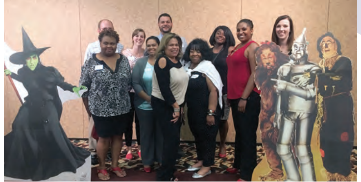
Guests have fun posing with the Wizard of Oz characters.